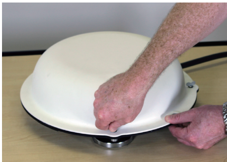
Close and lock the MARC-1 enclosure.