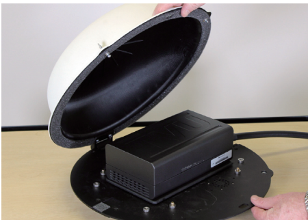
Place the modem module in the MARC-1 and attach the USB power cable.