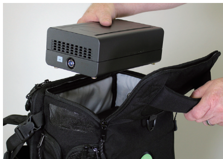
Remove the detachable modem module from the TVPack TM8200 backpack.

TVU's MARC-1 is a plug-and-play solution that can convert the TVUPack TM8200 from a backpack to a vehicle-mounted configuration within seconds. With the MARC-1, the TM8200 modem module is connected to the transmitter via a custom extended USB power cable without the need for additional power sources.